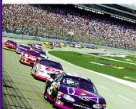
Texas Motor Speedway