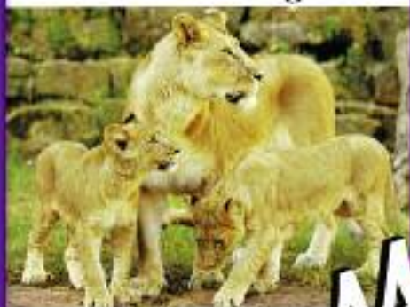
Ft Worth Zoo

FORT WORTH, TEXAS IS A THRIVING CENTER OF CULTURE AND COMMERCE. VISITORS ARE OFTEN SURPRISED BY EVERYTHING FORT WORTH HAS TO OFFER: THE HISTORIC STOCKYARDS, REMARKABLE MUSEUMS, A DAZZLING DOWNTOWN AREA, TEXAS MOTOR SPEEDWAY, SPECTACULAR ANNUAL EVENTS AND A LOT MORE! JOIN US IN FORT WORTH, TEXAS FOR THE 2011 MA NATIONALS!