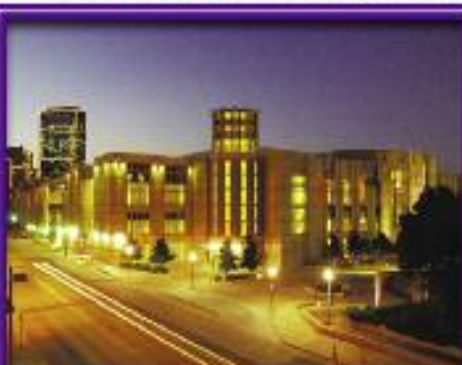
Ft Worth Convention Center